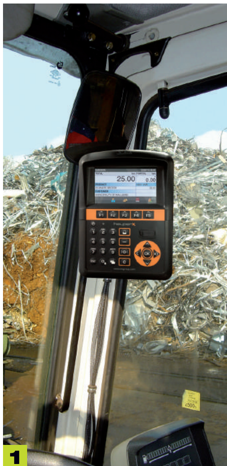
On-board instrumentation helperX