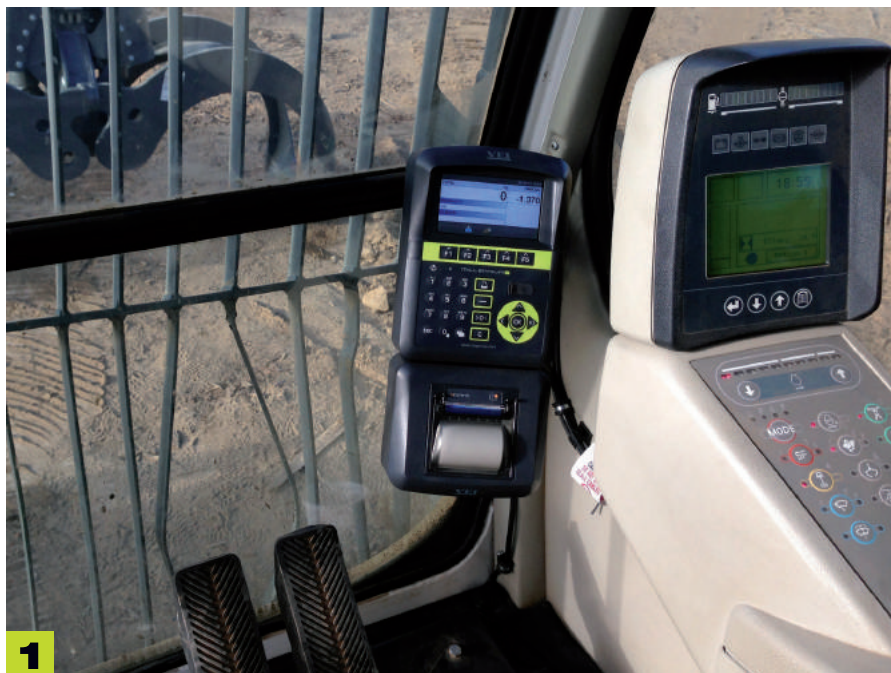
On-board instrumentation millennium5