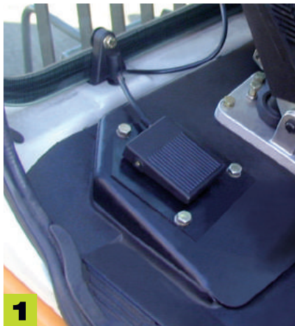
Totalizing option with push button using the machine lever free one